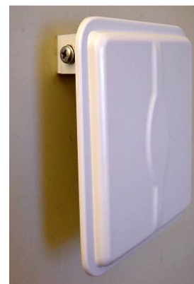
PA58-19 Surface Mount